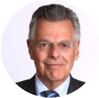
Dr. Myron Scholes | Professor of Finance 1991 Nobel Laureate in Economics