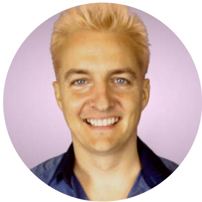
Murray Newlands | Contributor